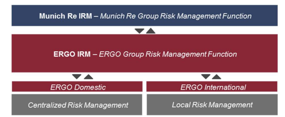
Figure 4. Risk Management Organization Munich Re and ERGO Group

In ERGO the risk management function is carried out by Risk Management division. The Head of Risk Management reports directly to the CFO. Reporting lines have been set up between the head of risk management function and ERGO Group CRO.